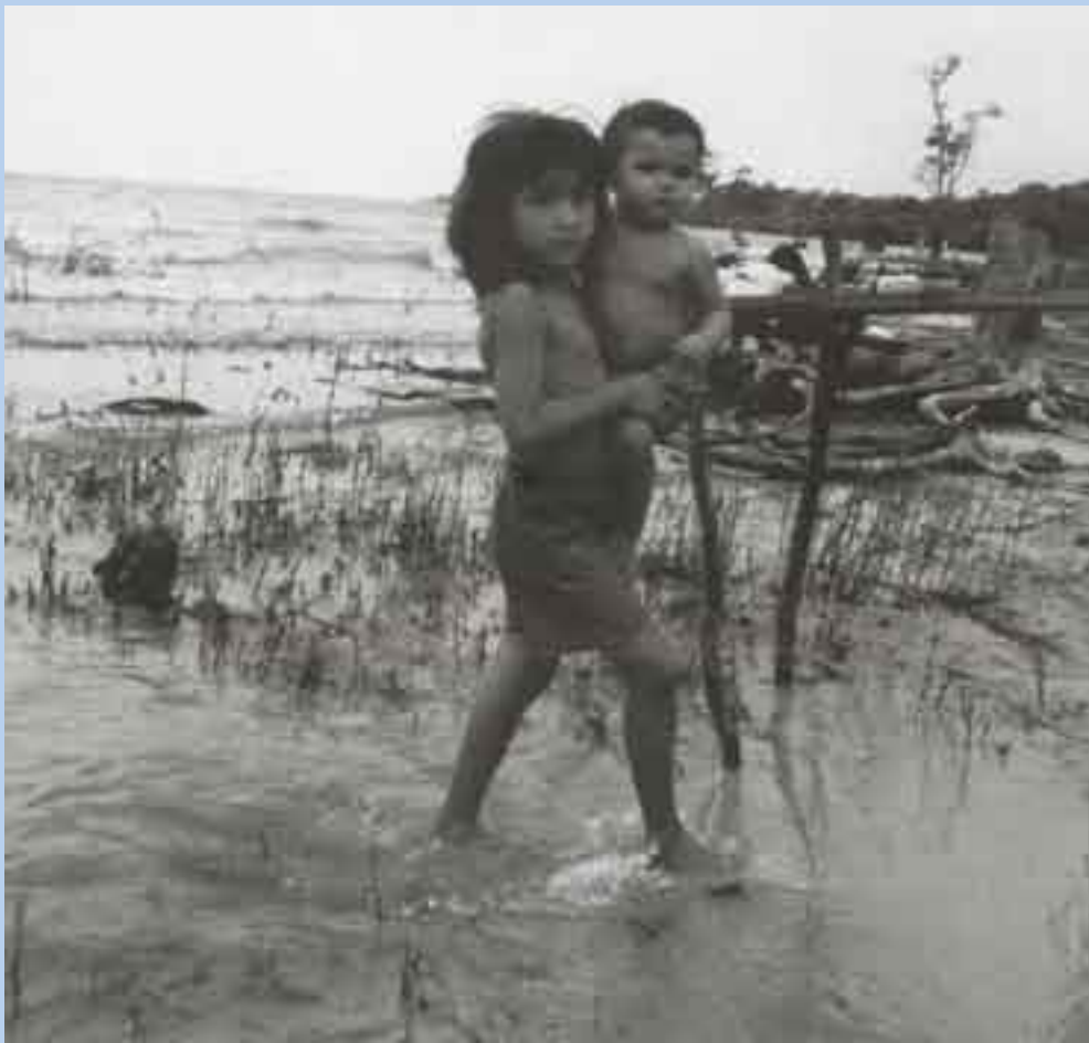
Girls from low-income families throughout the world, like this seven year old in Brazil, work from a very early age looking after children.